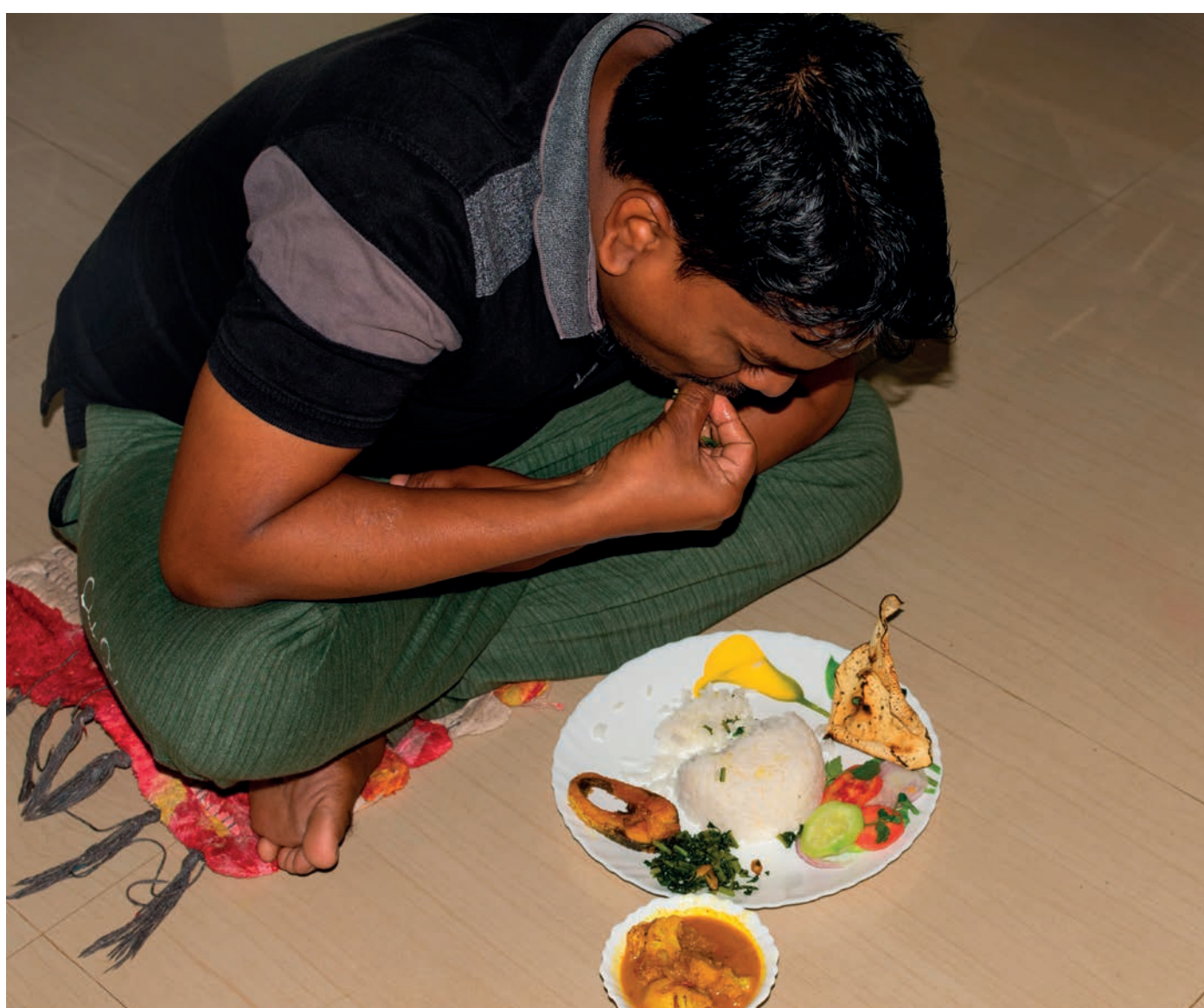
Using your hands.

What else can you use to eat besides a fork?