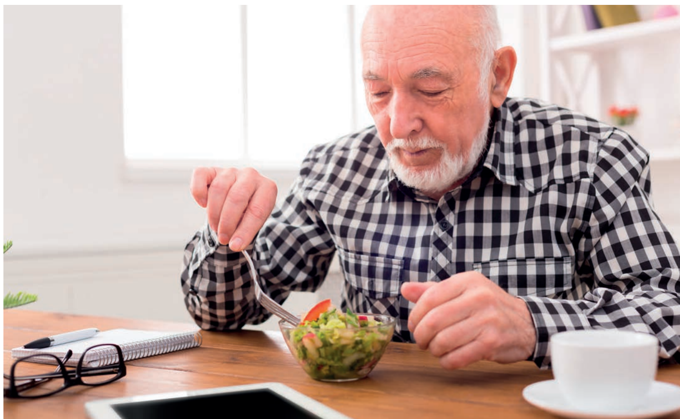
Using a fork.

Some people eat with knives and forks, and some people like to eat with their hands. They both enjoy their food.