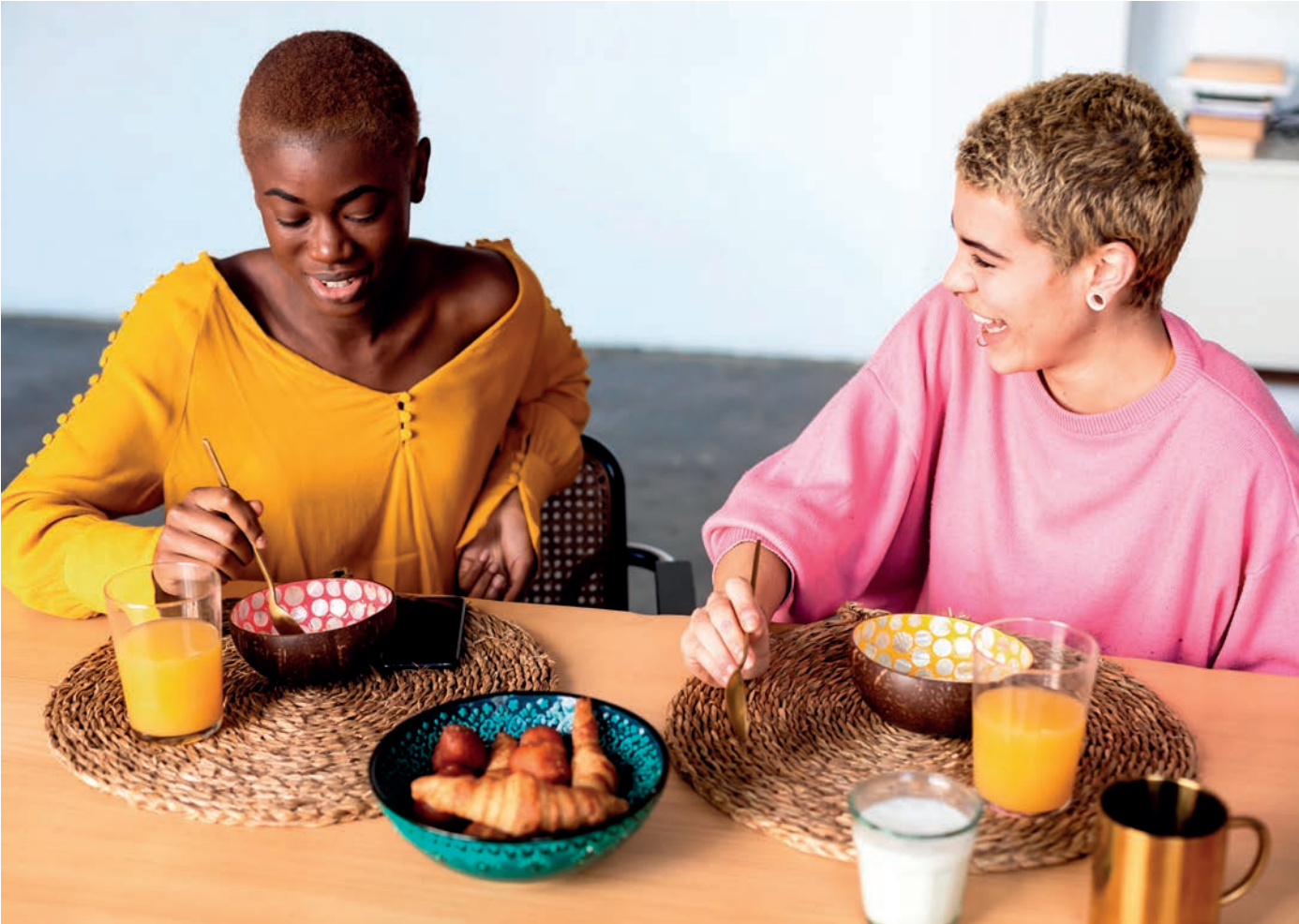
Sitting on chairs.